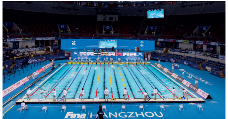
Hangzhou, China 2018 FINA WORLD SWIMMING CHAMPIONSHIPS (25m)