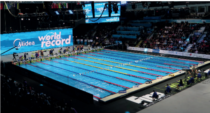
Windsor, Canada 2016 FINA WORLD SWIMMING CHAMPIONSHIPS (25m)